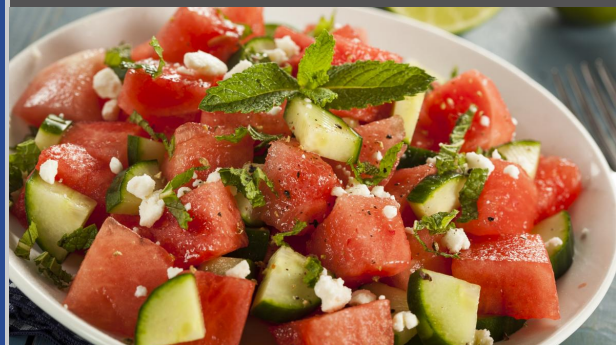
Watermelon Cucumber Salad

June's birthstone is the Ruby and birth flowers are the Larkspur, Tulip or Water Lily